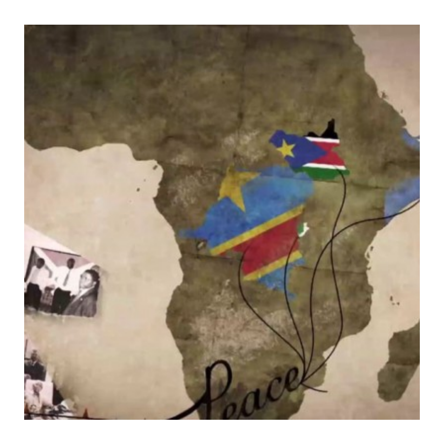
An Introduction to ACCORD