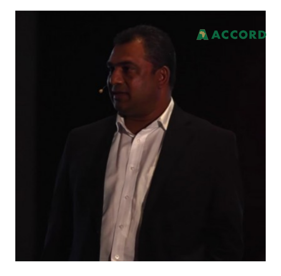
The Possibility of Peace in the 21st Century